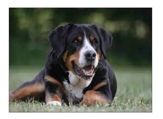
Swiss Mountain Dog