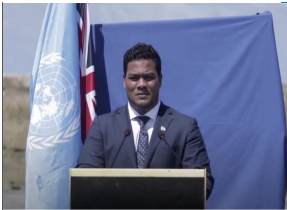
Tuvalu Foreign Minister, Simon Kofe